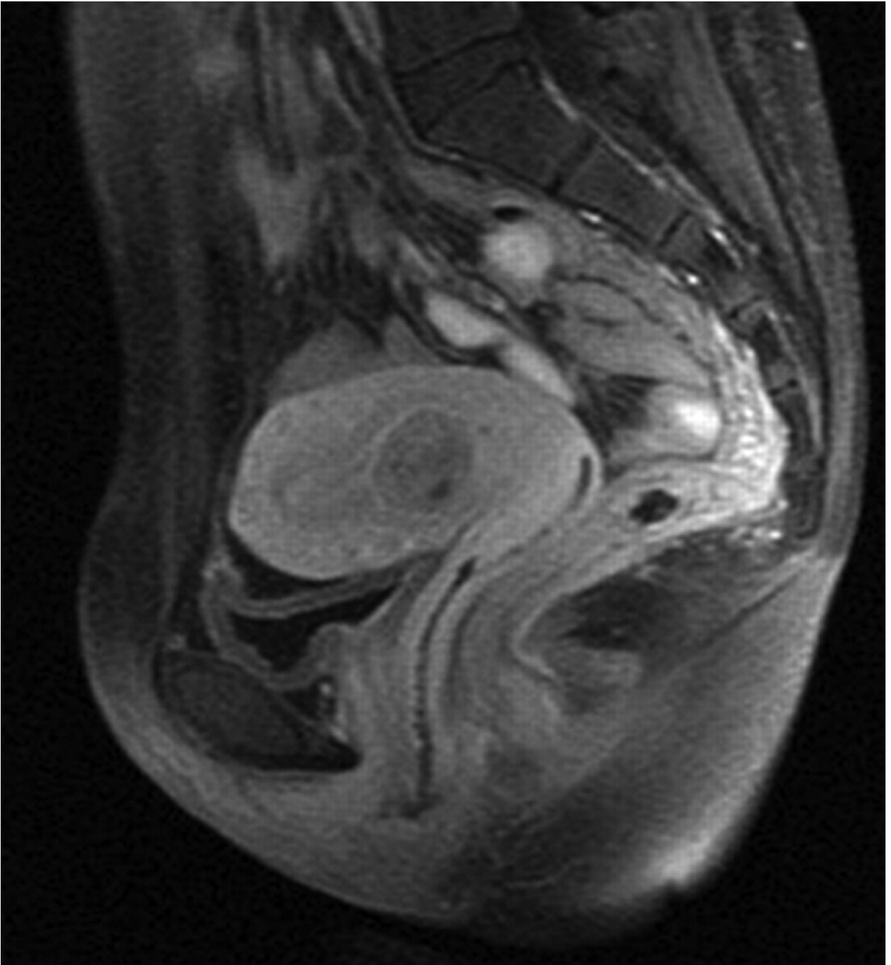
Illustration 2: MRI image from unknown woman. Growth visible in womb, but no effect on other organs.